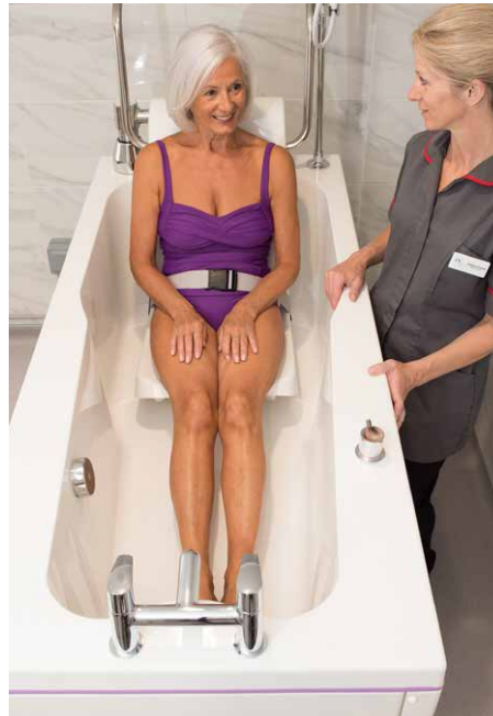
The keyhole bathing space delivers water and energy savings without compromising bather comfort

"At our Nottingham home, residents use the Gainsborough baths on a daily basis and continually provide positive feedback. We expect similar results from our Gentona's here at Ashlands Manor. The overall bathing experience Gainsborough provides encourages